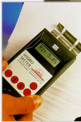
DM4A Digital Paper and Paperboard