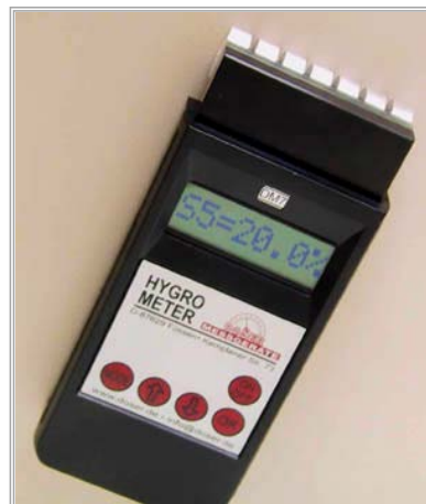
DM7 Digital Corrugated Board Paper Core