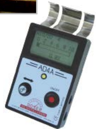
AD4A Analógico y Digital Paper and Paperboard