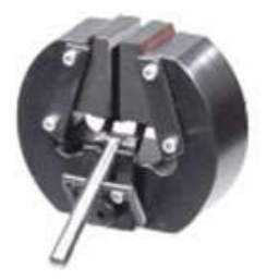
Wedge-type Grips (Metals - Plastics - Wires – Cables - Composites...)