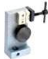
Bollard type Grips (Threads - Ropes - Wires Fine Ductile Cables ...)