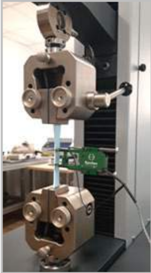
Extensometers Small Elongations