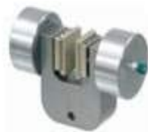
Pneumatic Grips (Film - Fabrics - Sheets...)