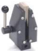
Manual Grips (Film - Fabrics - Sheets...)