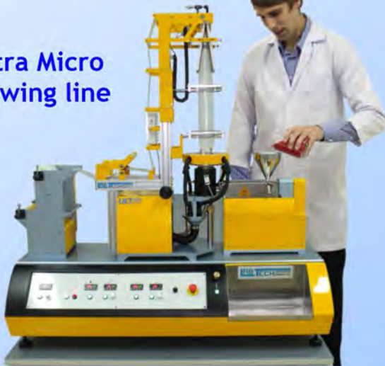
The Ultra Micro film blowing line