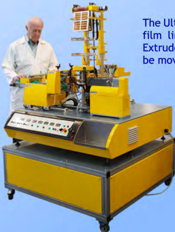
The Ultra Micro Co-Ex chill roll line

The Ultra Micro Combi line with both film blowing and cast film lines on the same platform, served by one Micro Extruder where each downstream attachment can easily be moved to connect to the common extruder