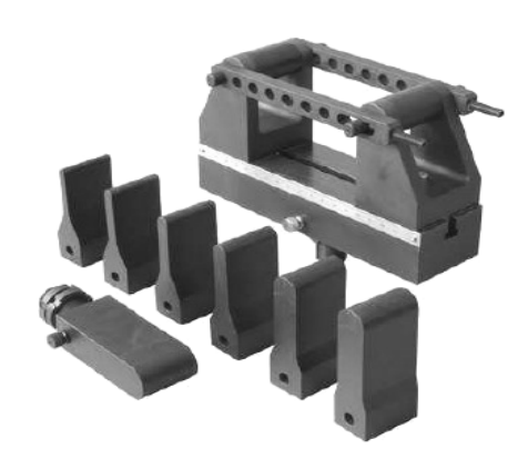
Bending/Flexure Devices (Metals - Plástics - Composites...)