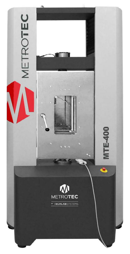
Thermal Test Chambers at different temperatures