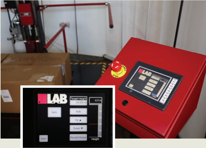
Intuitive and Operator Safe multi-position control station