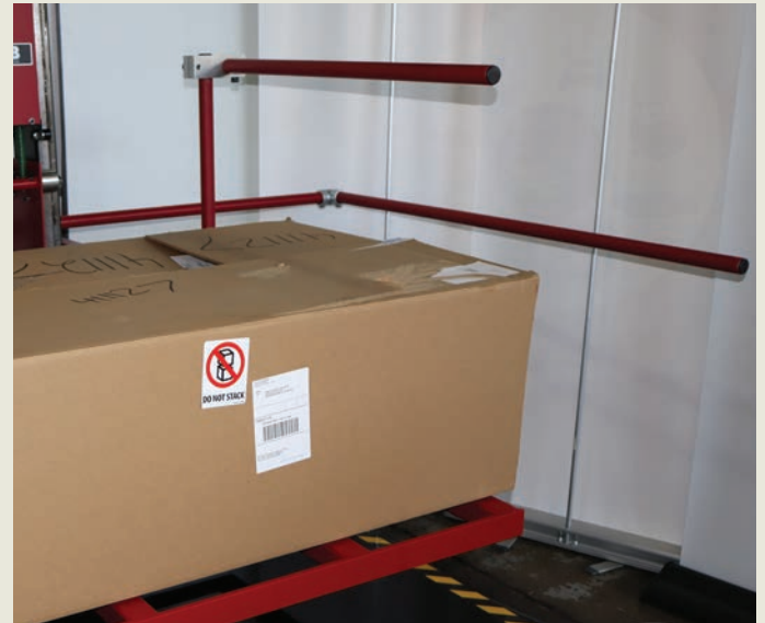
Extended Support Tines