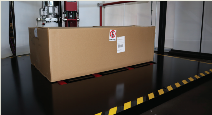
Expanded Base Plate for larger test items