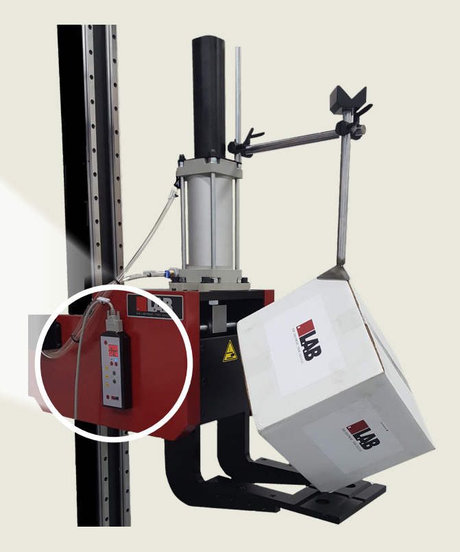
Package Holding Fixture